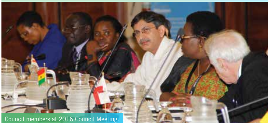
Council members at 2016 Council Meeting.

The Council will also discuss important constitutional amendments and plans for the forthcoming financial year, including CTO events, training and consultancy, Commonwealth coordination for major international ICT events next year and hosting of the upcoming Commonwealth ICT Ministers Forum, future CTO Forums and Council meetings.//