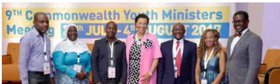
The Rt Hon Patricia Scotland QC (centre), Secretary-General, Commonwealth and participants at the Youth ministers meeting