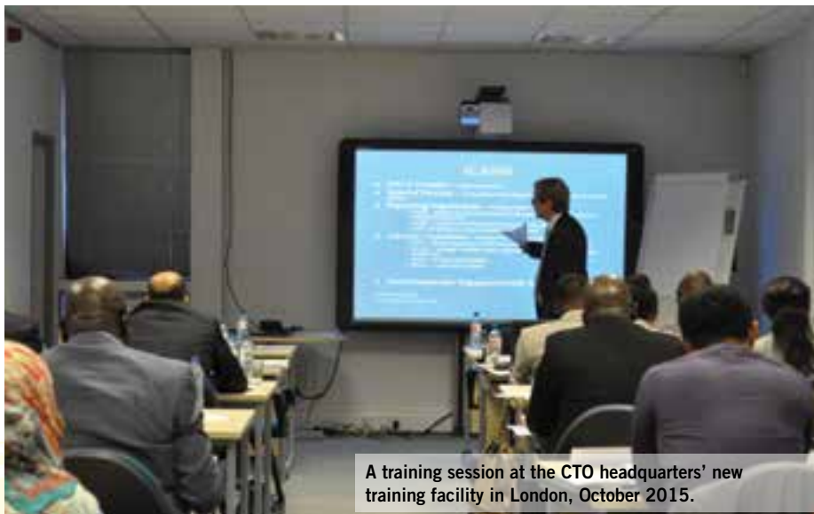
A training session at the CTO headquarters' new training facility in London, October 2015.

Handle tariffs, costing and competition-related issues is critical to the regulatory and legal environment