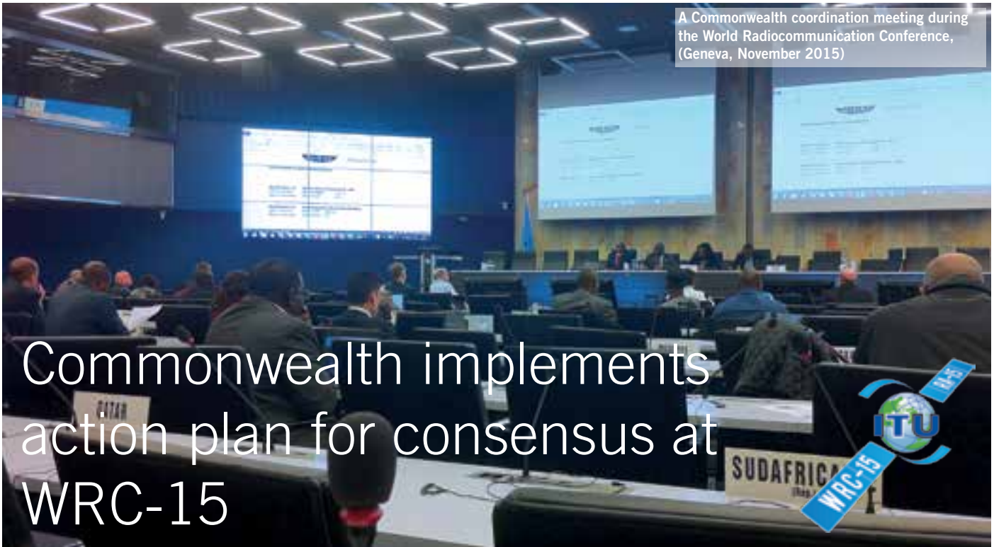
A Commonwealth coordination meeting during the World Radiocommunication Conference, (Geneva, November 2015)